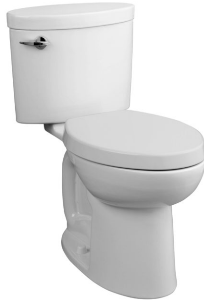
Seat shown above is not available. Please see Price Book for round front seat options.